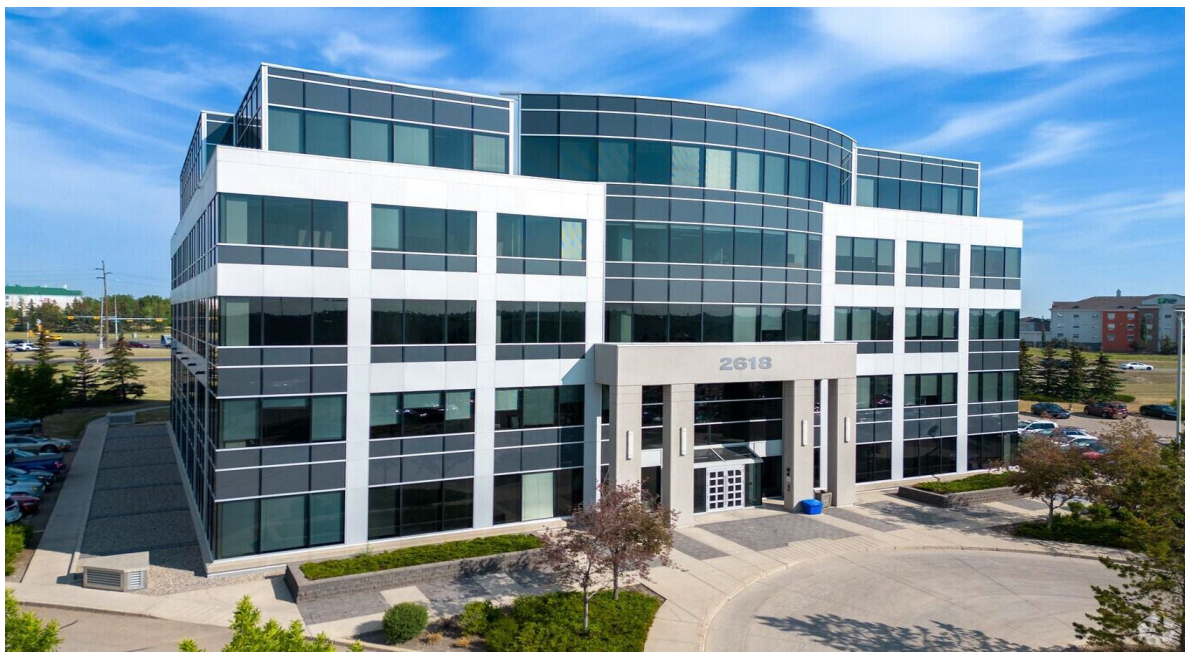
RCB College Campus Building

Our Mission: To empower learners to gain confidence and place them in their desired careers. Our Values: Flexibility and Accessibility, Student-Centered Approach, Diversity, and Inclusion.